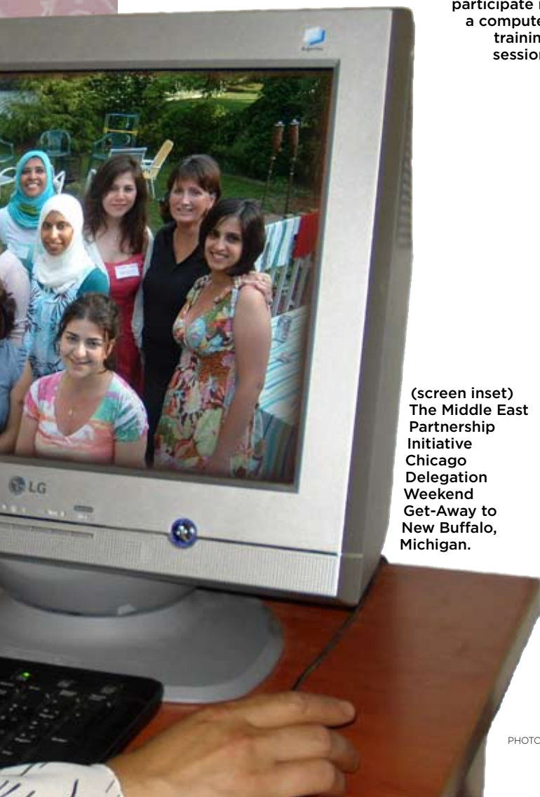
(screen inset) The Middle East Partnership Initiative Chicago Delegation Weekend Get-Away to New Buffalo, Michigan.