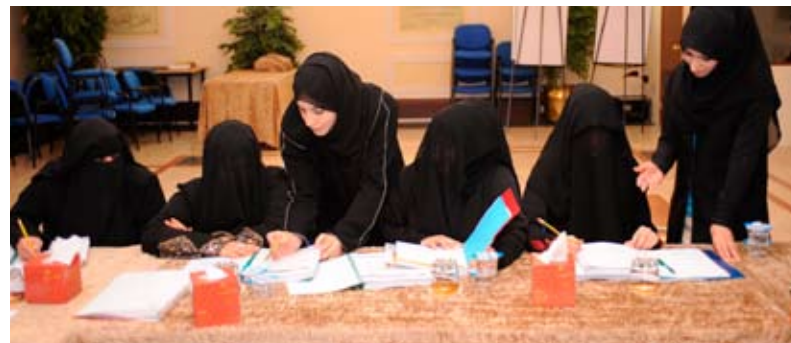
Women from the United Arab Emirates are assisted by trainers in a professional development program.

The program is offered to young women who attend school on scholarships or pay only low fees, and wouldn't otherwise have such opportunities.