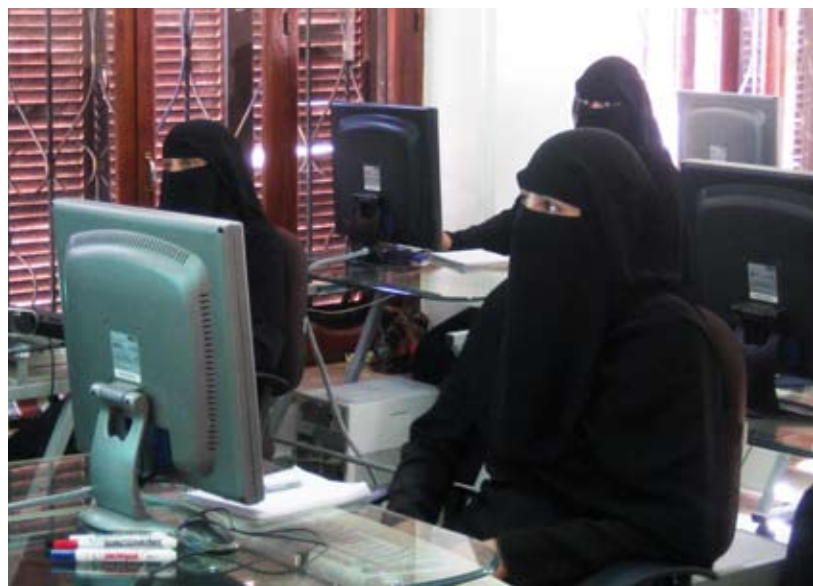
Women in Yemen participate in a computer training session.